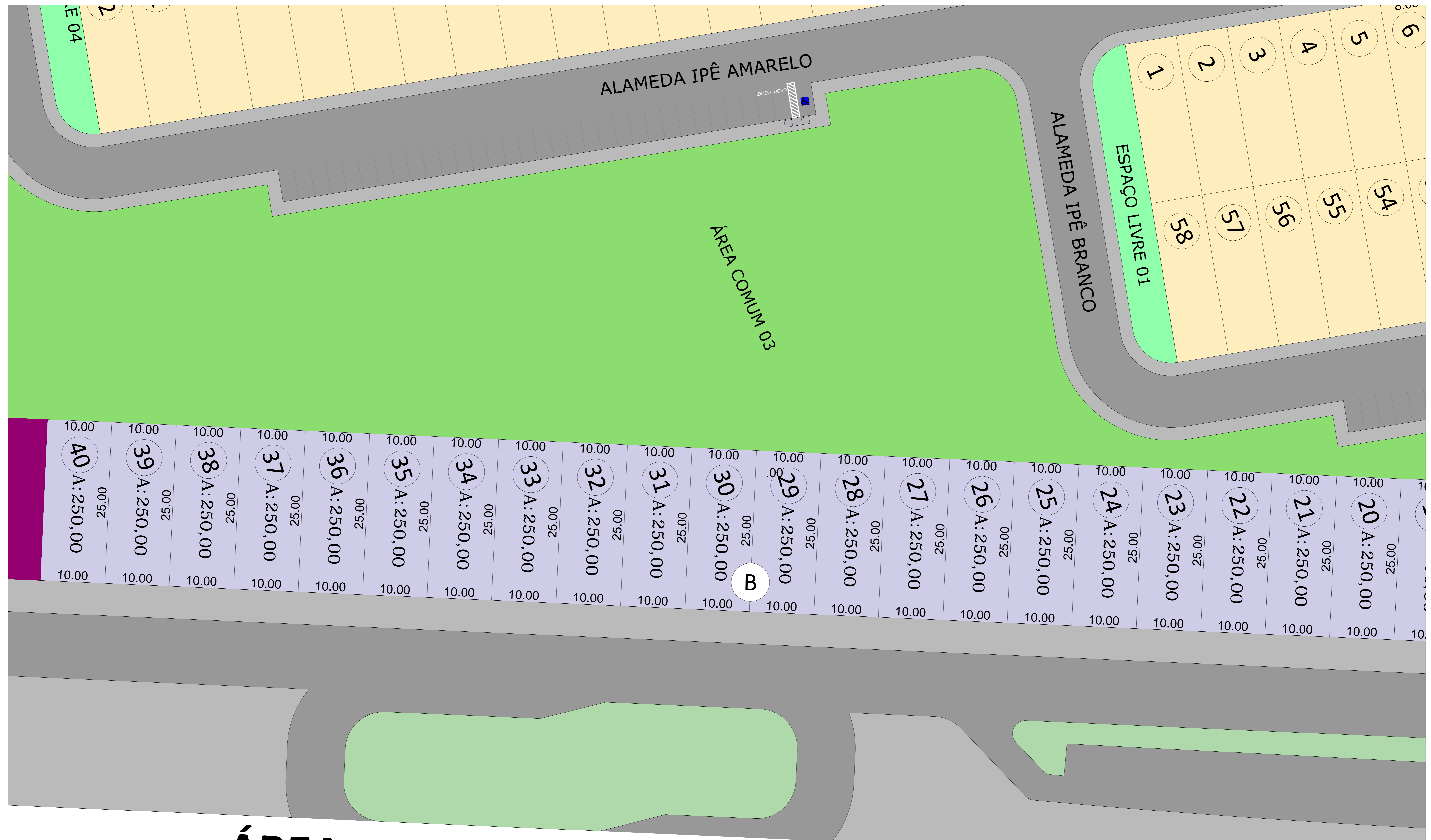
Detalhe: Lotes do 20 ao 40 Sem Escala